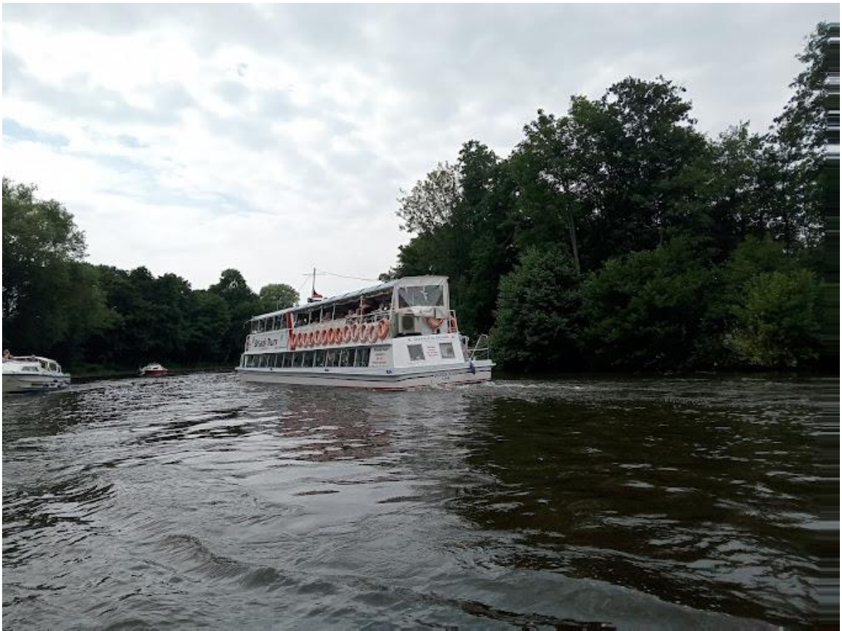
Riverboat tours on the broads