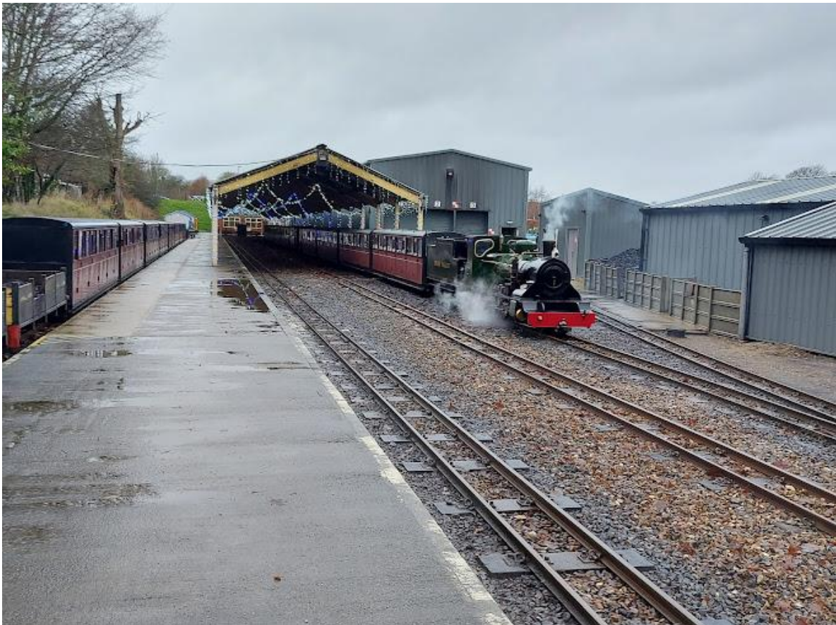
Bure Valley Railway