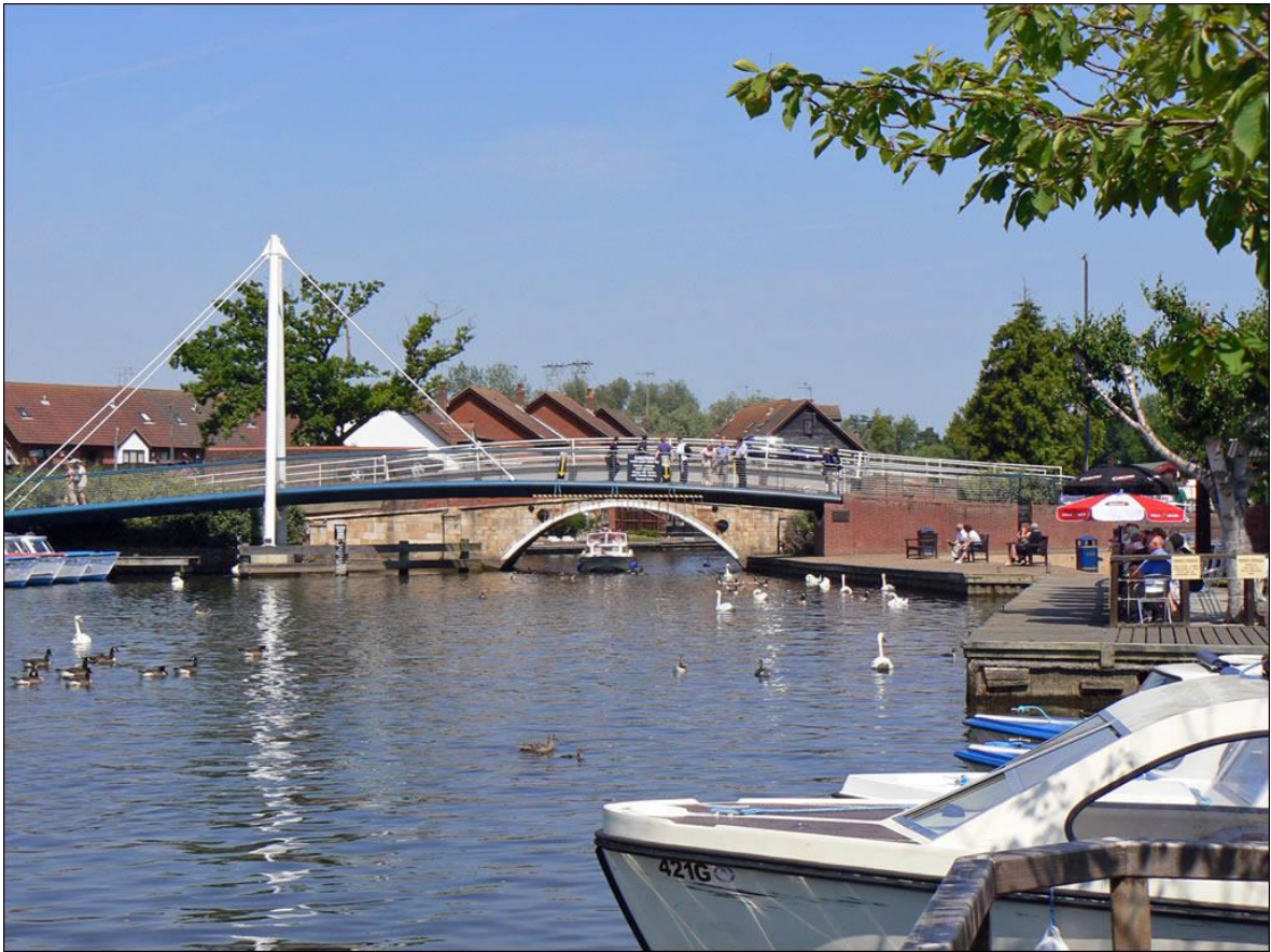
Wroxham Bridge over the River Bure