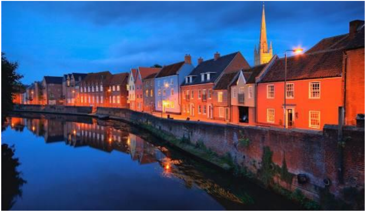
Housing by the River Wensum