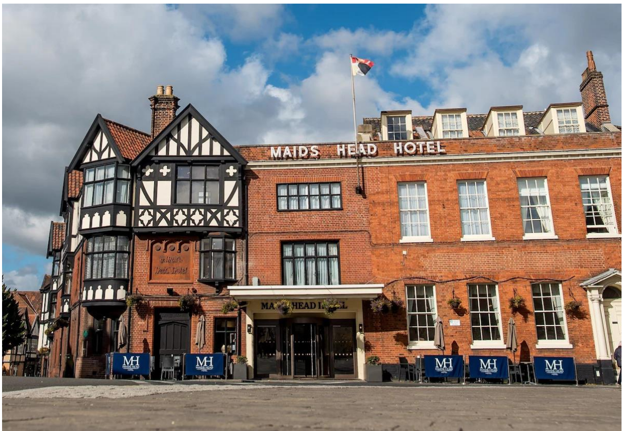
The Conference Hotel