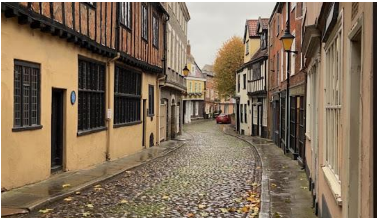
Elm Hill – Medieval cobbled street