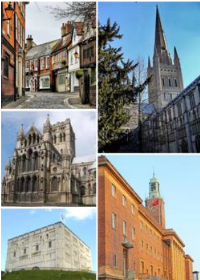
Clockwise from top left: Princes Street, Norwich Cathedral, Norwich City Hall, Norman Castle, Roman Catholic Cathedral