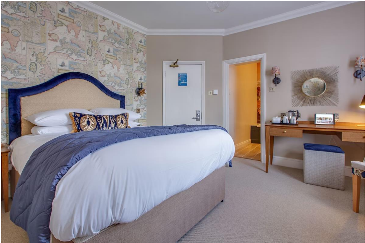
Standard Double Room