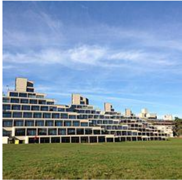
University of East Anglia – opened 1963