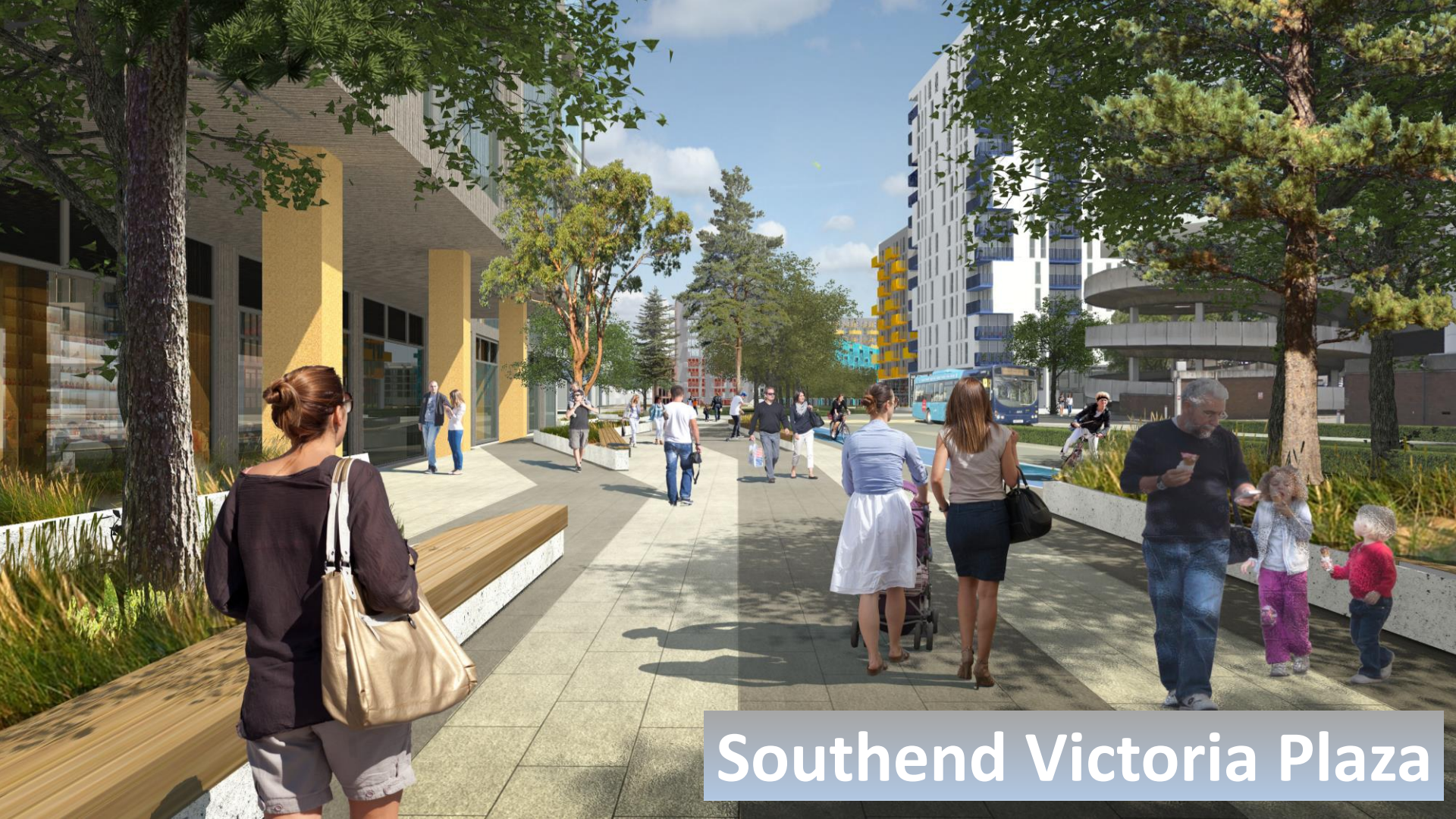
Southend Victoria Plaza