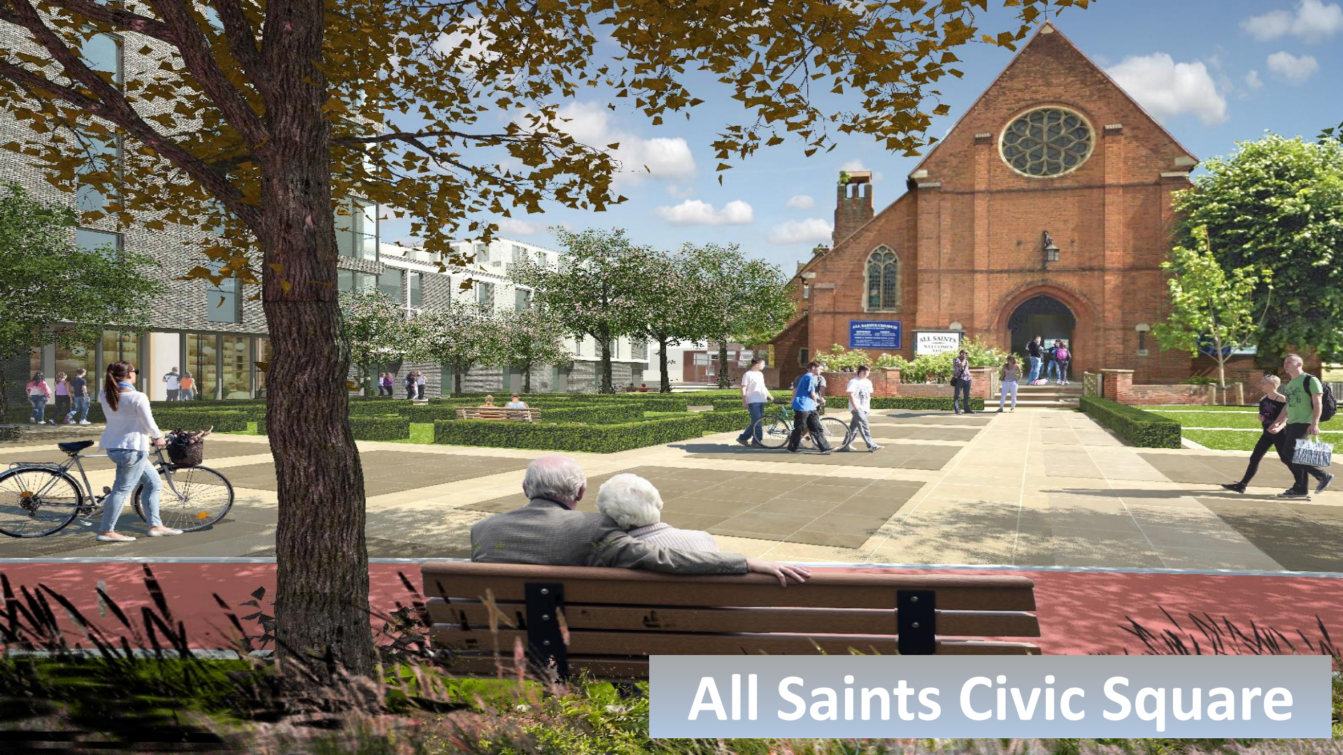
All Saints Civic Square